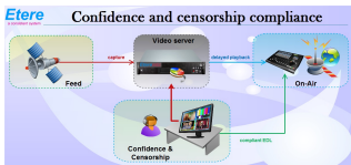
Censorship workflow Diagram