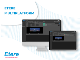
Etere Web Multiplatform