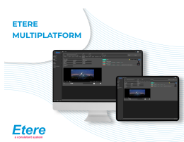
Etere Web Multiplatform

Blitz Film and Video Distribution, a leading film distributor in Zagreb, has been using Etere Ecosystem to drive its ad insertion for Pay TV channels since 2021. With the successful launch of the project, the company decided to increase the number of channels in their Etere system.