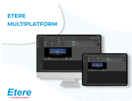
Etere Web Multiplatform