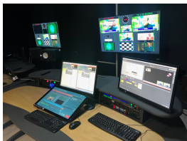
Georgian Public Broadcaster

As a satisfied user of Etere, Georgian Public Broadcasting (GPB) renews its confidence in Etere with an upgrade to the latest Etere 34. GPB is Georgia's national public broadcaster. GPB selected Etere Ecosystem in 2020 to manage its three channels' automated broadcasting, planning, playout, and media assets. This year, GPB upgrades to Etere 34 to leverage the benefits of the new features and to optimise the performance of their system.