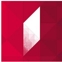
Georgian Public Broadcaster