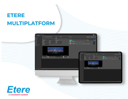
Etere Web Multiplatform