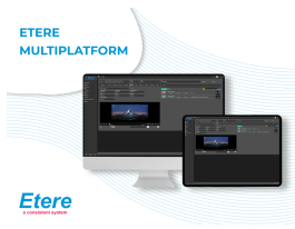
Etere Web Multiplatform