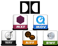
Supported formats for Loudness Control

ETERE is pleased to announce the release of Loudness Control, the plugin that greatly enhances the capabilities of ETERE Hi-Res Transcoder and enable broadcasters, production houses and media companies to automatically measure and adjust the audio loudness of their media content.