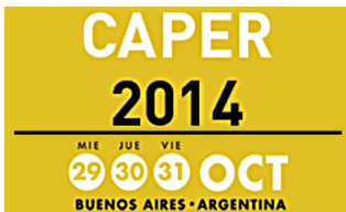
Logo of CAPER 2014

Join us from 29-31 October at Buenos Aires (Costa Salguero Centre, Hall 4, SVC Stand #C10) to get firsthand demonstrations on the broadcast industry's most powerful, complete and innovative solution: ETERE MERP.