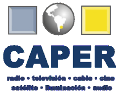
CAPER event Logo