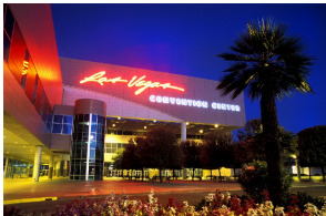
Las Vegas Convention center