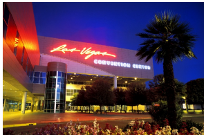
Las Vegas Convention center

NAB 2015 is a great opportunity to look at the latest innovative and advanced broadcast cloud software solutions developed by Etere for broadcasters and media companies. Attendees can discover a wide range of technology software with ERP design to improve the efficiency of their workflows while cutting costs.