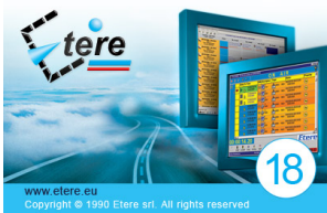
Etere SRL 18