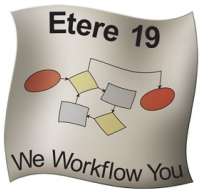
Etere 19 we workflow you