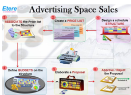
Advertising Space Sales