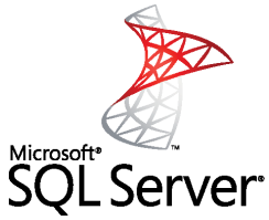
The logo of Microsoft SQL Server

Microsoft has recently announced the release of the much awaited SQL Server 2008 which promises to facilitate even further the complex task of database management.