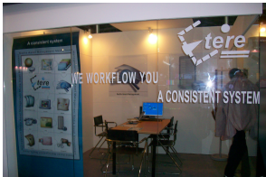
Broadcast Asia 2009