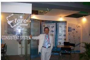
Broadcast Asia 2009