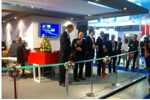
Broadcast Asia 2009

Etere confirm its Leading Position in the Asian Market by Participating at the 14th Edition of the Asia's Largest Broadcast Event