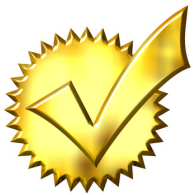
Advanced Quality Check

Etere Advanced QC, a fully featured, comprehensive video file quality check system with better features and performances than any other competitive system.