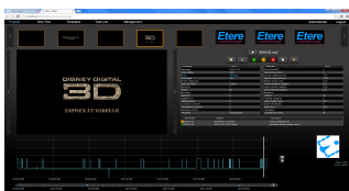
Etere Advanced QC

Etere is adding yet another module to its highly effective Etere MERP solution and that is the much anticipated advanced video quality check system, Etere Advanced QC . The addition of Etere Advanced QC strengthens Etere's position to manage the complete lifecycle of any media or broadcast company with a total software solution that is ready to grow with the company.