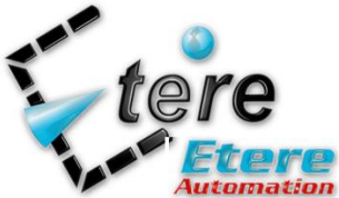
Etere Old Logo

After the big success of the last year, ETERE will take part at BES Expo in New Delhi on 9th-11th February 2006 (Taj Palace Hotel).