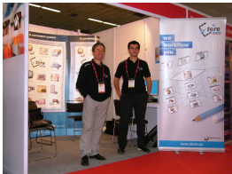
Bes Expo 2010 Booth

ETERE, a leading global provider of broadcasting solutions, is pleased to announce that it will be exhibiting the most comprehensive products in the broadcasting industry at the 2010 BES edition from 29th to 31st January in New Delhi. BES EXPO is the India's biggest broadcasting technology show that in the last years has counted with the participation of the most important broadcasting companies of the entire world, making of it the ideal event to present to the Indian's market Etere's latest business strategies and system capabilities.