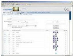
Etereweb Software interface