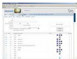
Etereweb Software interface