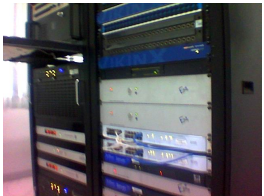
Solar TV Project