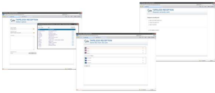
Tapeless Reception GUI

The comprehensive management and transfer of digital media is only as effective as the level of awareness and efficiency surrounding said transfer.