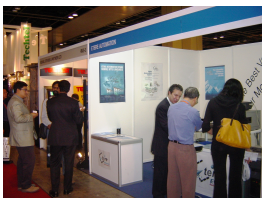
Etere exhibits at BCASIA 2002

ETERE will expose its products even on this year's edition of the major Asian broadcast exhibition, but this year ETERE is going to have its own stand (4N2-3), necessary because of the big success this software-house has in that part of the world.