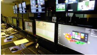
U-Life master control room

U-LIFE, a Taiwan's leading home shopping television network based in Taipei, has chosen Etere to manage the playout of its five cable channels.