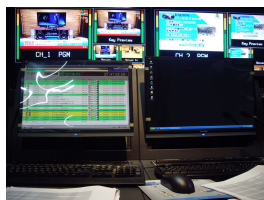
U-Life master control room