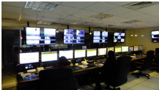
U-Life master control room