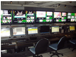
U-Life master control room

U-LIFE has chosen Etere and its Taiwanese partner N-Type to manage the playout of its five cable channels. A distributed Etere system has been deployed to provide U-LIFE with a full-caching environment, enabling them to deliver five different channels via Cable Television. U-Life is using Etere Automation to send on-air five channels' schedules including secondary events such logos and transitions. The overall playout system include a backup automation system ables to replace any Main Automation in case of failure. Moreover, each Automation controls an independent video routers, offering a dedicated management and enhancing the overall playout fault tolerance. Some workstations in Live Studios have been equipped with Matrox XMIO video cards to manage video contents coming from NLE systems and play them in HD format using Etere MTX driver integrated in Etere Cartwall, a powerful tool used in production environment that gives fast access to all video contents and allows to manage simple playlist and manual playout.