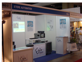
BROADCAST ASIA 2001