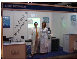
BROADCAST ASIA 2001

As usual Etere will be a participant of the largest broadcast convention. In the Asiatic continent: Broadcast-Asia (June 19th –22nd) host to more than 780 exhibitors. Etere and SeaChange, the American leader in video server, are teaming-up to show the latest Etere software implementations.