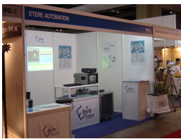
BROADCAST ASIA 2001