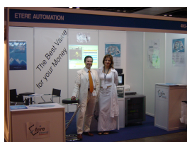
BROADCAST ASIA 2001

As usual Etere will be a participant of the largest broadcast convention. In the Asiatic continent: Broadcast-Asia (June 19th –22nd) host to more than 780 exhibitors. Etere and SeaChange, the American leader in video server, are teaming-up to show the latest Etere software implementations.