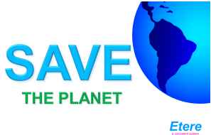
Save The Planet

Etere is a GREEN company. Please help us to reduce the environmental impact by downloading all the information you need from our new corporate site www.etere.com