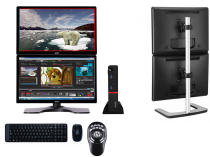
Censorship Double Monitor