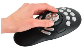
Support for Shuttle Pro Contour