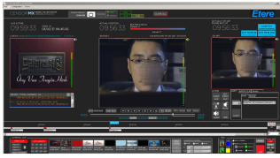
CensorMX Blur Effect