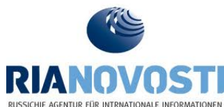
RIA Novosti company logo

Etere provides a complete package required for the automation systems for Ria Novosti