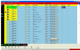
Automation On Air