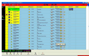
Automation On Air