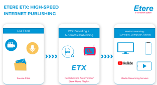
Workflow of ETX Streaming