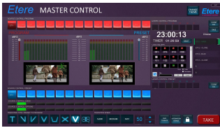
ETERE MASTER CONTROL