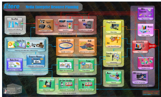
Media Enterprise Resource Planning