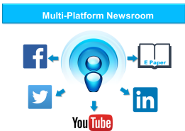
Nunzio Newsroom Multi-platform

4K technology sets the stage for a truly immersive and cinematic experience. Be at the forefront of technology with Etere 27.1 which includes ETX with 4K compatible technology, capable of delivering a truly exceptional video quality: