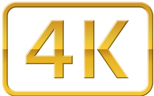
4K is supported

With the new upgrade, Etere Memory comes equipped with support for multiple codecs including H264. Memory is also integrated with QC for signal and loudness control. An advanced option includes the program's recognition based on fingerprints.