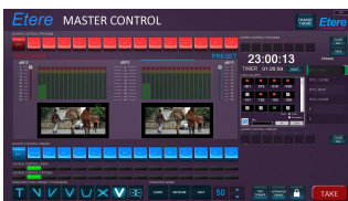
ETERE MASTER CONTROL

Etere ETX is now compatible with Matrox DSX, DSXLE3 and XMIO2 cards. All users of MTX system can upgrade to ETX at no additional costs. 4k-ready ETX is one of the most innovative video management system and channel-in-a-box on the market, based completely on IT technology. It is compatible with a wide range of video cards and third-party hardware, providing one of the best interoperability in the market.