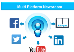
Nunzio Newsroom Multi- platform

4K technology sets the stage for a truly immersive and cinematic experience. Be at the forefront of technology with Etere 27.1 which includes ETX with 4K compatible technology, capable of delivering a truly exceptional video quality: