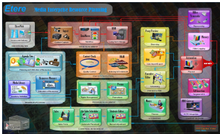
Media Enterprise Resource Planning