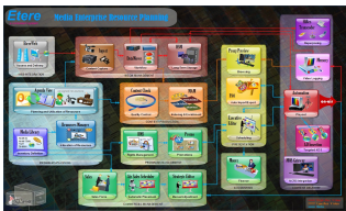
Media Enterprise Resource Planning