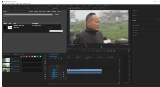
Screen Adobe Premiere Pro