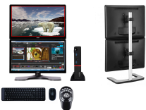
Censorship Dual Monitor