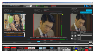
Mosaic Effect Feature