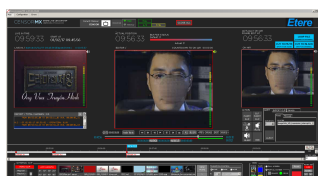
Blur Effect Etere CensorMX

With the upgrade, CensorsMX is able to manage a variety of file formats including TGA, JPEG and BMP. Image upload is easier and faster.