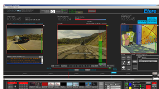
Multiple Audio Tracks Feature