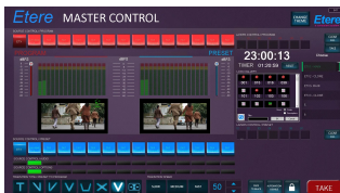
ETERE MASTER CONTROL