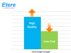
Etere Budget Packages