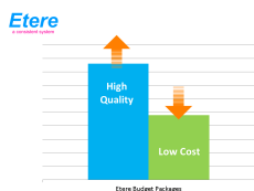
Etere Budget Packages