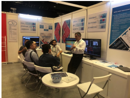
Etere at BCA2018

See you at Broadcast Asia 2018 which will be held from 26th June to 28th June 2018 at Suntec Singapore Convention & Exhibition Centre. Book an appointment with us now for an in-depth demonstration of Etere solutions! Etere will be at Booth 6F4-01.