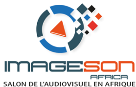
salon Imageson Africa