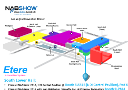
Etere at NABshow 2018 Floor Plan

Meet the Etere team at NABshow 2018, from April 9-12 at Booth SL5516 (NDI Central Pavilion), Pod 6, Las Vegas Convention Center. Our distributor, Stonefly, inc. will showcase Etere solutions at Promise Technology Booth SL7624. Schedule an appointment with us at info@etere.com