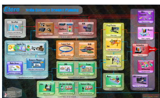
The Etere Framework

Etere will be showcasing the latest Etere plugin for Adobe Premiere Pro CC at NABshow 2018 from April 9th to 12th at Las Vegas Convention Centre, Booth SL5516 (Pod 6). Etere Media Enterprise Resource Planning (MERP)'s flexible architecture, high reliability, and efficiency provide a centralized management of digital content and integrative workflows for all your broadcasting needs. Etere's plugin for Adobe Premiere Pro CC features seamless integration with Etere MERP solutions to provide all the professional tools needed from a single interface, without exiting the NLE environment.