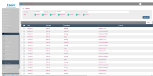
Airsales Price List Grid