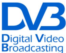
Logo of Digital Video Broadcasting

Etere Subtitle Tool is capable of managing all your closed and open caption requirements including ARIB and Digital Video Broadcast (DVB) closed captions directly via Etere ETX CIB or ETX inserter for legacy systems. Not only that, subtitling can also be imported or exported from standard formats including EBU, TXT, STL, PAC, XML, SAMI and SCC. These features empower the user to convert the actual database or to drive an external system.