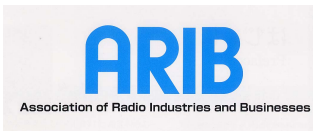
The logo of ARIB

Etere Subtitle Tool introduces compatibility with ARIB (Association of Radio Industries and Businesses) closed captions for digital broadcasting, alongside with its support for DVB (Association of Radio Industries and Businesses) closed captions . Faced with the expansion of content distribution options and formats, media professionals often require highly efficient and reliable tools to meet dynamic broadcasting requirements. The multi-format capabilities of Etere Subtitle Tool for Closed Captioning make it possible to manage all closed and open captions requirements, including live captioning, multi-language and multi-platforms subtitling. Both fast and accurate, Etere Subtitle Tool enables users to insert or modify closed captions in a matter of minutes, even just before broadcast.