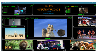
Screen of ETX-M Multiviewer

Etere 28.1 opens the doors to a new age of virtualization with fully compliant DVB streaming capabilities supported in both Etere ETX and ETX-M IP Multiviewer . With an Etere solution, there is no need for expensive hardware encoders. Etere is moving towards a fully virtualized system, empowering its users with the ability to manage playout, graphics, master switcher and encoder as a software-only solution, leading to reduced hardware reliance and better cost-efficiency.