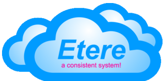
Etere Cloud Logo