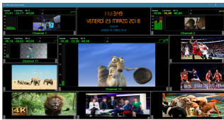
Multiple screens of ETX-M