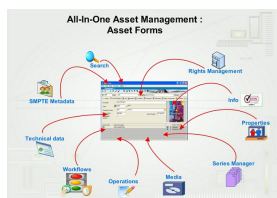
MAM asset form

National Archives of Australia maintains the records of the Australian Government agencies that form the archival resources of the nation. It manages nearly 500,000 audiovisual assets in multiple formats including motion picture films, videos, audio recordings and digital formats created by the Australian Government. With the integration of Etere Media Asset Management (MAM) , the National Archives of Australia is empowered with one of the most efficient software tools available on the market to manage and control its collection of audiovisual assets.