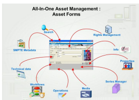
MAM asset form

National Archives of Australia maintains the records of the Australian Government agencies that form the archival resources of the nation. It manages nearly 500,000 audiovisual assets in multiple formats including motion picture films, videos, audio recordings and digital formats created by the Australian Government. With the integration of Etere Media Asset Management (MAM) , the National Archives of Australia is empowered with one of the most efficient software tools available on the market to manage and control its collection of audiovisual assets.