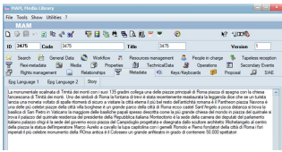
Insert the transcript in story field

Etere supports the integration of Nuance Dragon for automatic audio and file transcriptions directly from the Etere interface without the need to switch screens. Etere is THE solution to complex problems and its seamless interoperability with a wide range of third party solutions is a part of its commitment to providing one of the industry's best flexibility and performance to users.