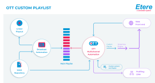
OTT Custom Playlist

Scheduling is an essential part of any broadcasting workflow. Etere Executive Editor provides the software tools needed to plan, prepare, manage and insert the preparation of the broadcasting scheduling grid in advance. This includes the placement of licensed content, programs, series, promos and commercials even prior to the acquisition of content. Etere provides users with the flexibility to execute last minute amendments before broadcast. It features media preview and loudness control as part of its suite of features.