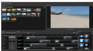
Video Editor Main Interface