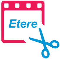
Etere Video Editor

Etere is proud to announce Etere Video Editor the latest extension of the Media Asset Management solution. Integrated with MAM, users can easily edit assets directly from MAM database.