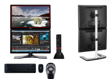
CensorMX Dual Monitor