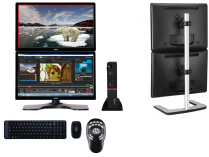
Censorship Dual Monitor

Etere CensorMX now has a new version, the Etere CensorMX Simple , optimised to provide the necessities of seamless censorship at a lower price.