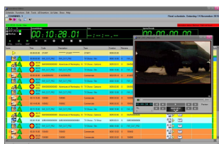
Executive Editor Screen GUI