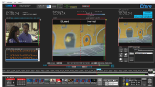
Censor EX Program Blur