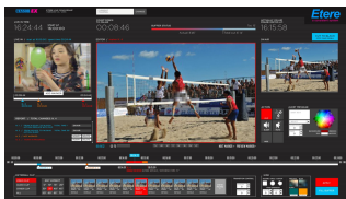
Censor EX Mosaic Effect